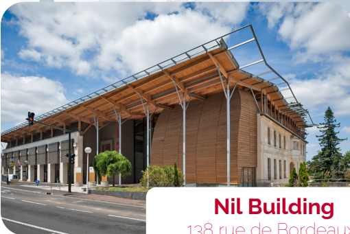
Nil Building 138 rue de Bordeaux