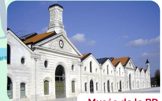
Musée de la BD

② Car park located at the Musée de la BD, then take the footbridge across the Charente River to get to the Nil Building.